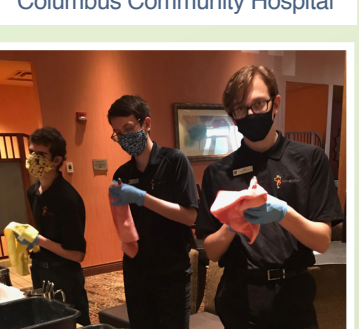
Embassy Suites Omaha - La Vista