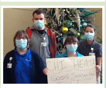
CHI Health Good Samaritan