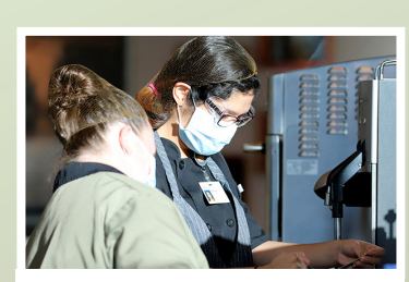
CHI Health Saint Francis